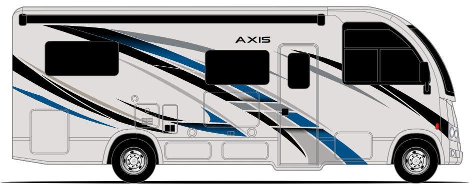
BLUE CHIP MAX