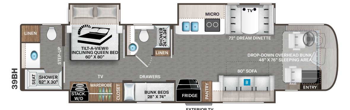
Options Available on Select Floor Plans: