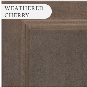
OPTIONAL LUXURY COLLECTION