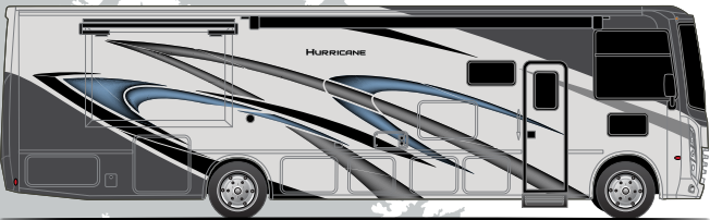
GULF BLUE PARTIAL PAINT