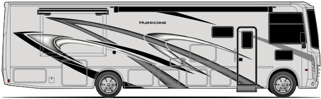
POLAR WHITE QHD-MAX