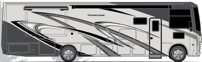
CLOUD BANK PARTIAL PAINT