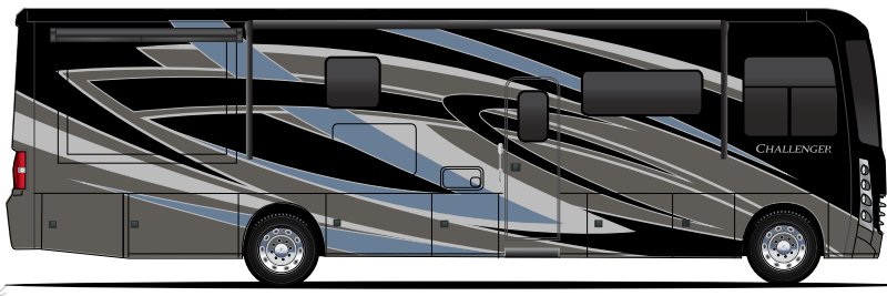
MARINA BAY III